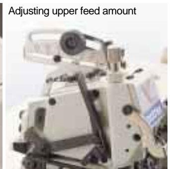
Adjusting upper feed amount