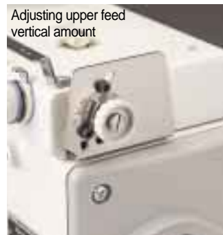
Adjusting upper feed vertical amount

The amount of up and down movement of the upper feed dog can be adjusted at one touch using the external lever. The optimum amount of feed for the cloth thickness can be obtained.