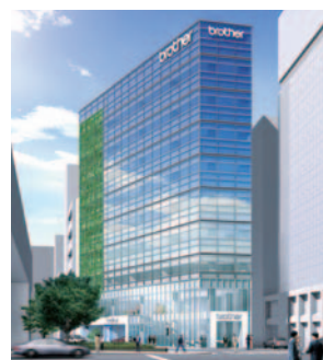
Artist's Rendering of New Tokyo Office Building (scheduled for completion in March 2010)