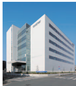
Research & Development Center